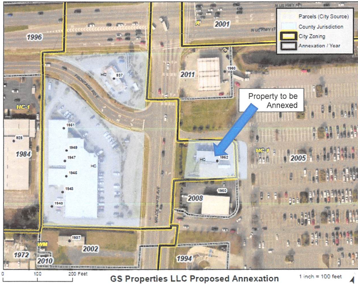
Exhibit A Ordinance 2021-25